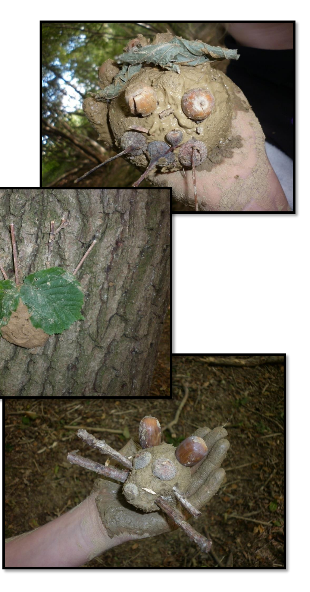
Page 23 of 23